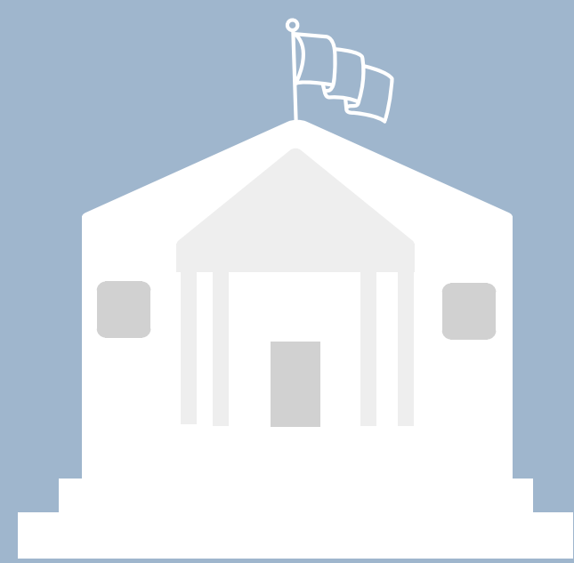
library as place

Goal 2: Established readers of all ages will have access to activities, services, and resources that satisfy and encourage their reading needs.